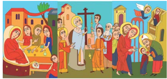
THE TWELVE GREAT FEASTS OF THE ORTHODOX CHURCH

The activity book for children entitled The Twelve Great Feasts of the Orthodox Church presents the stories of the major Feasts, each followed by a series of engaging activities. The texts are written in a language that is accessible to younger audiences, while the colouring illustrations in the Byzantine style, the multiple choice questions, the word games, and the other writing activities are designed to engage younger as well as older elementary school children.