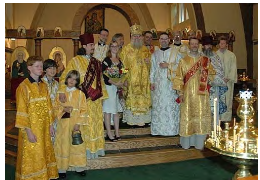
At the ordination.