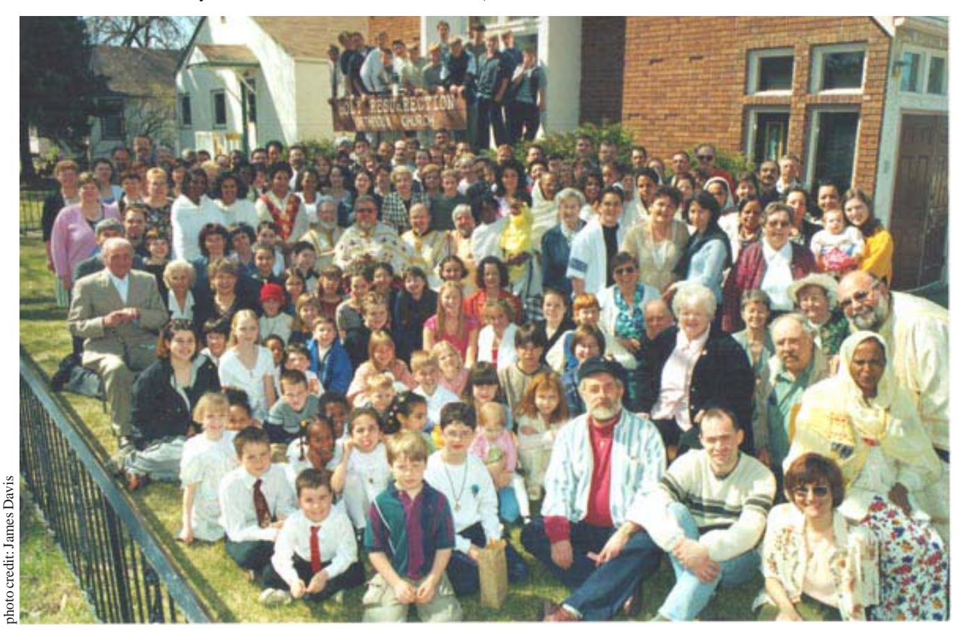
Parishioners of Holy Resurrection Sobor, Saskatoon, on the occasion of the parish's 25th anniversary.

In almost three decades, Holy Resurrection has grown to a hundred ethnically-diverse families (including Eritrea,