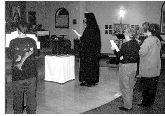
Every day of the course began and ended with prayer, above.

To the left are the course participants.