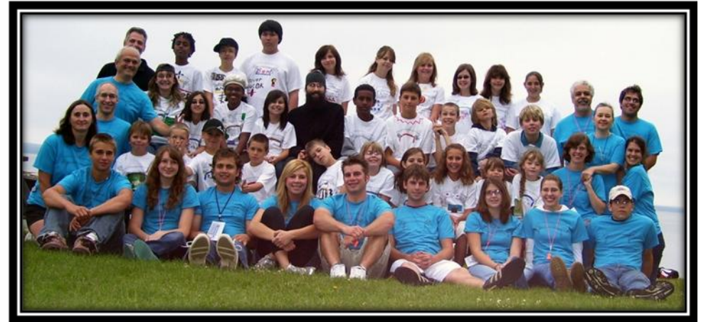
St. Peter the Aleut Staff and Campers 2007

WHO can come to camp?? Students Grade 2-9 (as of June 1 st , 2008)